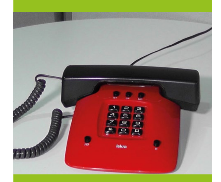
Automatic telephone Iskra Eta 80, 1986.