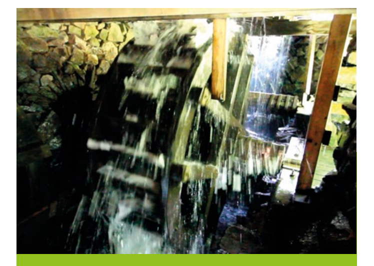
Water wheel, Gränna, Sweden.

Currently the Europeana interface is available in all the languages of the EU member states. We need a common language to facilitate the sharing of sounds and information in the database across Europe. Therefore the metadata will be English, and the searchable keywords will be both in English and national languages. The vast and reliable metadata in this database also offer an extra educational dimension, which makes it different from the sounddatabases that can currently be found on Internet. There will be photos and, in some cases films, to illustrate the sounds.