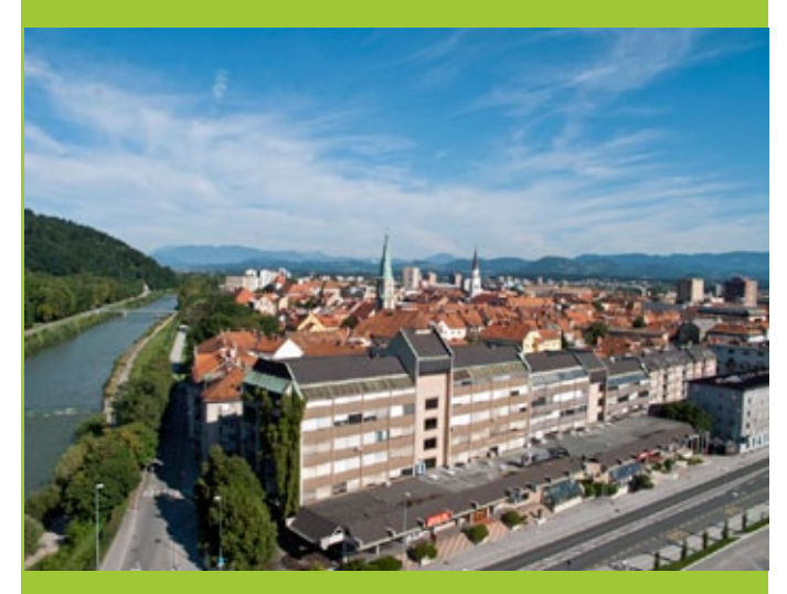
Old city centre of Celje.