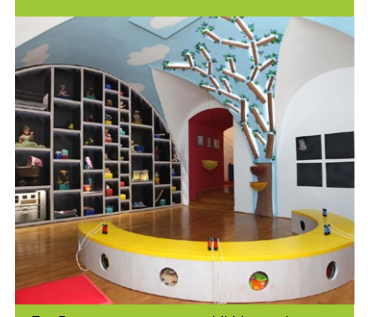
Toy Den, new permanent exhibition at the Museum of Recent History Celje.