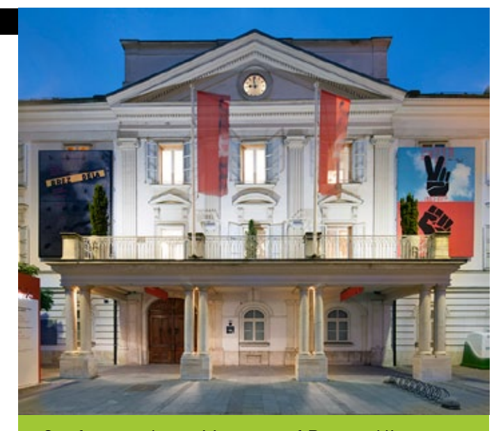
Conference host: Museum of Recent History Celje.

For questions, please contact comcolcelje@gmail.com