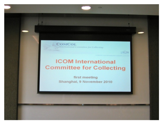
The first image of the first power point presentation at the first meeting of the committee!

During ICOM's General Conference in Shanghai 7-12 November 2010, COMCOL organized two successful sessions. Despite the omission of the announcement of our meetings in the General Conference Programme, both were well-attended by delegates from all over the world, and also so inspiring that they immediately resulted in new members joining the committee.