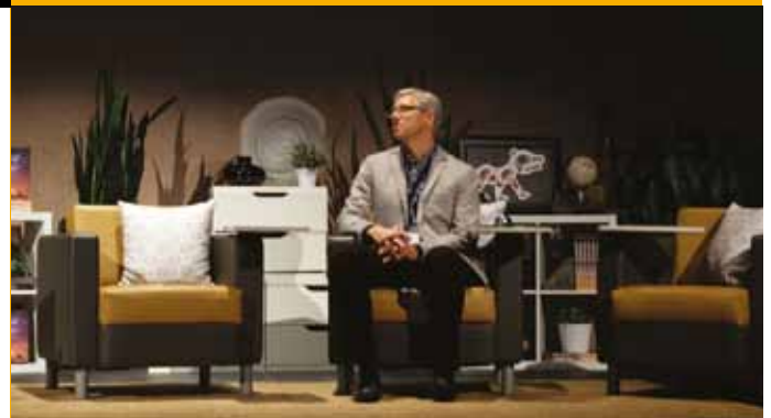
Contemporary Collections: Contested and Powerful, COMCOL Annual Conference 25 -28 September 2018, Winnipeg Canada

Alina Gromova talked about how the Jewish Museum in Berlin launched the project Object Days, in an effort to