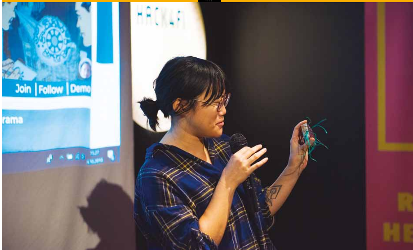
Presentation during Hack Your Heritage Hackathon in Helsinki