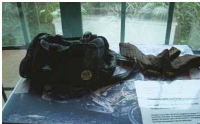
Handbag and necktie retrieved from the site and donated for exhibition.

The objects presented illustrate that moments of rupture, like the bombing of the embassy, are