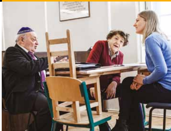
Family Barsky, Jewish Community in Regensburg, March 2017

This paper been adapted from an earlier publication: Kiprof Lagat (2018) Contested memorialization: the 1998 Nairobi terror attack on the United States embassy, World Art, 8:2, 161-185, DOI: 10.1080/21500894.2017.1414715