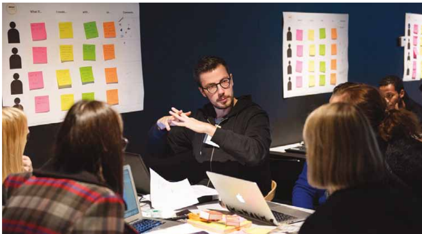
Working during the Hackathon

Hackathons are based on open data, in this case open digital culture. Open culture refers to material freely available on the internet to be shared and adapted for any purpose. Either the material is in public domain or made available by other means e.g. licensed with Creative Commons Attribution 4.0 International Public License (CC BY 4.0.). For some, open collections in this sense and magnitude sound like a beautiful but unrealistic idea. Resources, copyright laws, data protection regulations and even in some