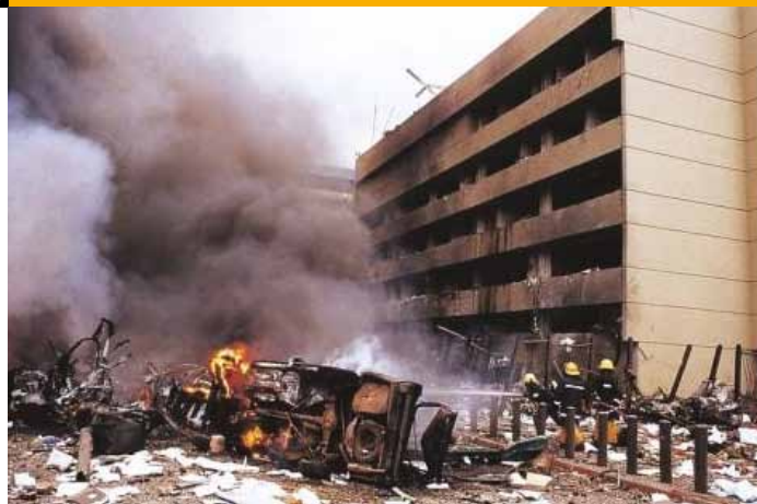
The bombed U.S. embassy building, Nairobi, 1998

Immediately after the terror attack, activities were mooted to help people work through the collective trauma. These ranged from musical vigils to performance art as well as visual art exhibitions. A memorial park, the August 7th Memorial Park, was also