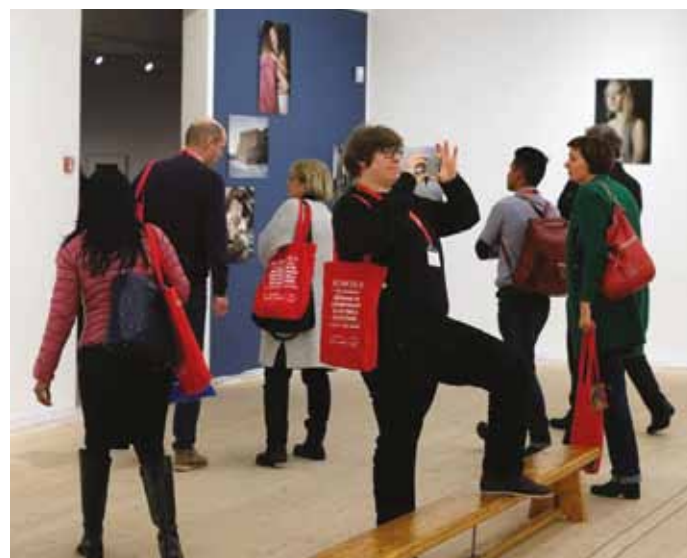
Participants of the 2017 COMCOL conference in the Västerbottens Museum Umeå, Sweden

2) The second point of discussion was the acquisition process of museum objects. Acquisition policies and processes are permeated by rules, procedures and policies that do not always depend exclusively on the will of the institution, since its capacity to change is variable. In other words, contemporaneity demands not only new views on museum objects but also on acquisition processes. In practical terms, much has been discussed about acquisition models that imply shared responsibility among source communities, local communities and museums. Such interaction between these players would allow for the implementation of