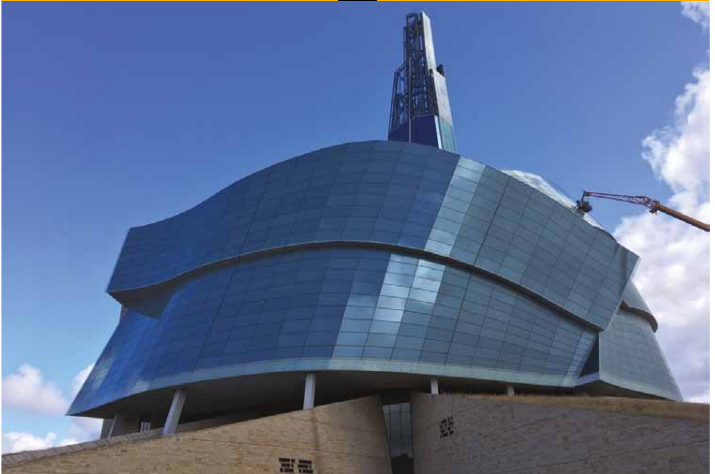
Museum of Human Rights in Winnipeg, Canada