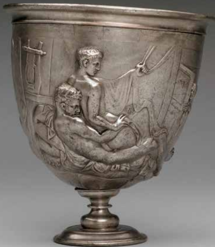
Warren Cup

Seksuele en genderdiversiteit in erfgoed