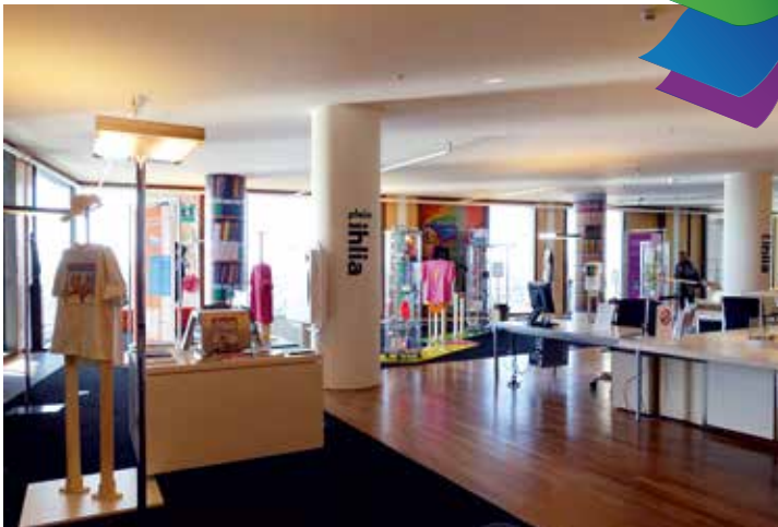
Current exhibition at IHLIA | 6th floor