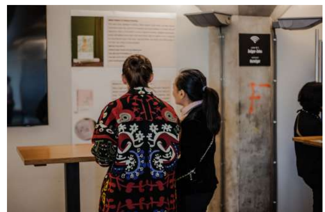
Thursday 10 and Friday 11 October – conference days at Pakhuis de Zwijger