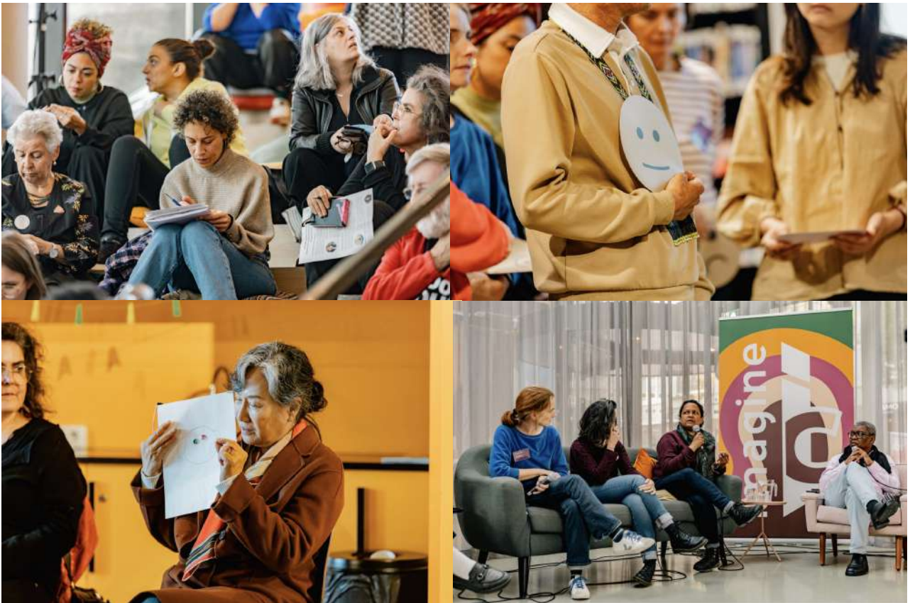
Saturday October 12 – Special program at Imagine IC